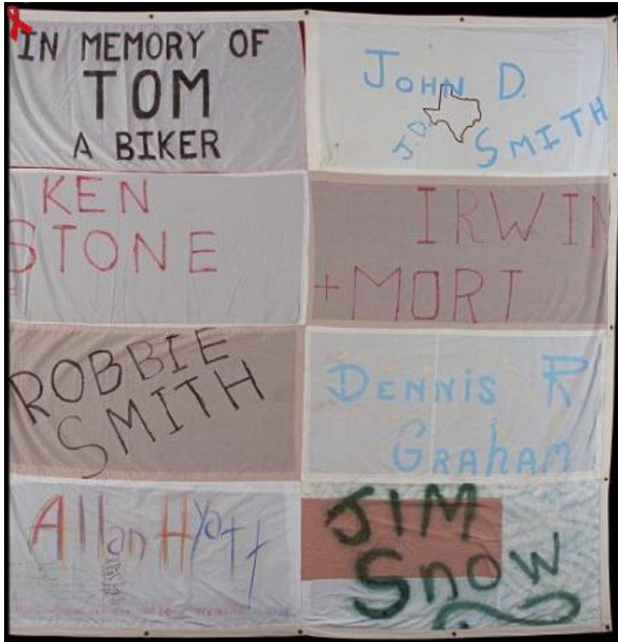
Names on Block #116

Leader -3: Hello. My name is _____. I am in_(city) _____, _____(State)_____. Scroll the page to see the panel names on Block # 116.